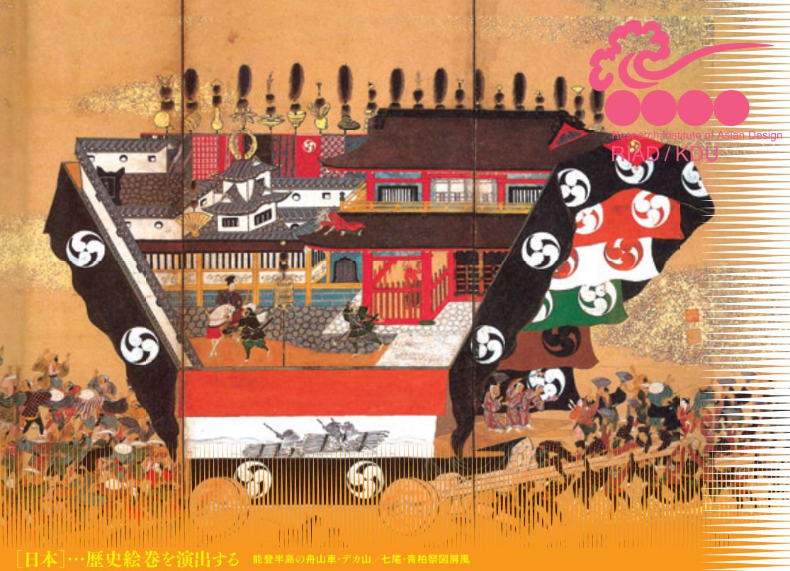
[日本]…歴史絵巻を演出する 能登半島の舟山車・デカ山 七尾・青柏祭園屏風

Our Second International Symposium will focus on the designs of "boat-shaped floats" from Myanmar, Thailand and Japan. Decorated with dragons and sacred birds, and crowned with Buddha statues, these vessels are entrusted with carrying the souls of the deceased to the next world.